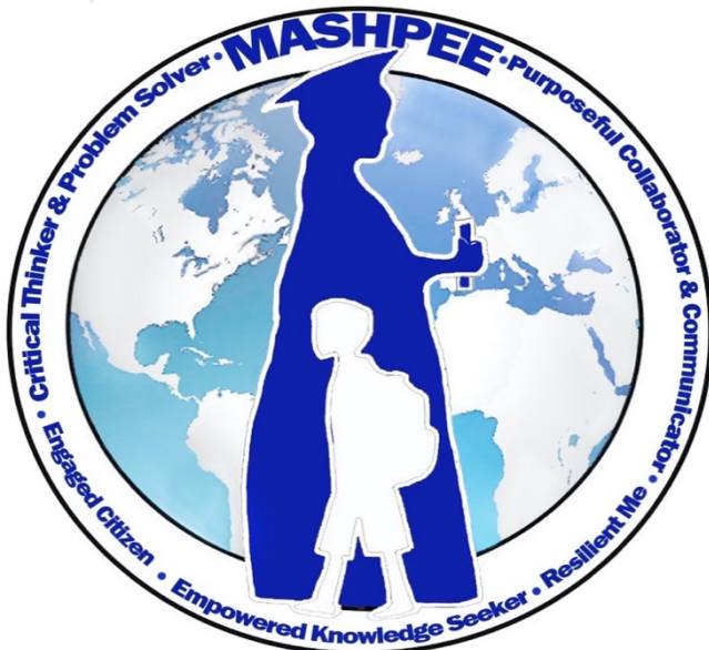
Mashpee's Portrait of a Graduate